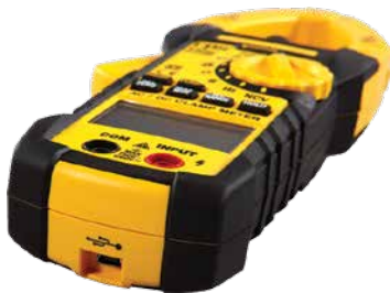
USB data connection