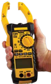
Extra strength grip clamp